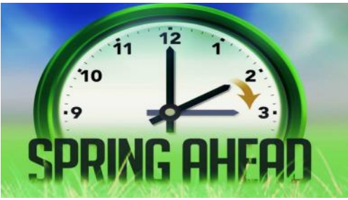
Don't forget to set your clocks ahead one hour on March 9.